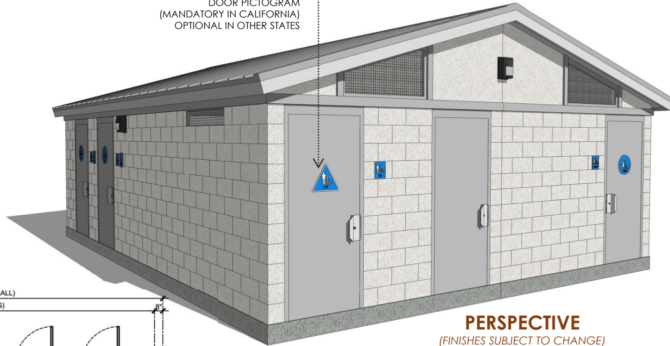
PERSPECTIVE (FINISHES SUBJECT TO CHANGE)

NOTE: DOOR PICTOGRAM (MANDATORY IN CALIFORNIA) OPTIONAL IN OTHER STATES