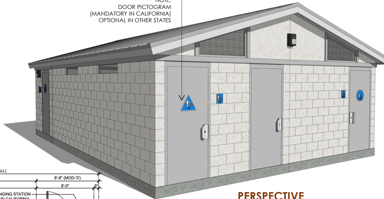
PERSPECTIVE (FINISHES SUBJECT TO CHANGE)

NOTE: DOOR PICTOGRAM (MANDATORY IN CALIFORNIA) OPTIONAL IN OTHER STATES